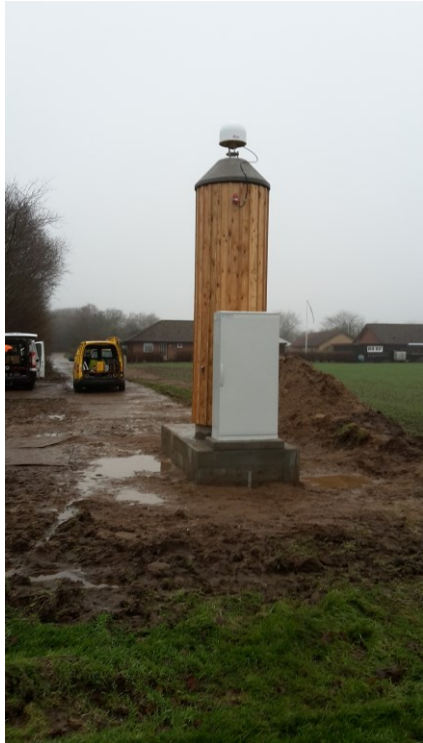
New Class A station in 2017