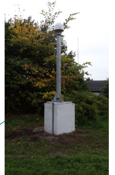
New twin station i 2017